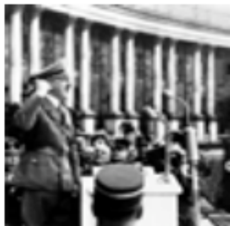
"It's the Jews' fault"